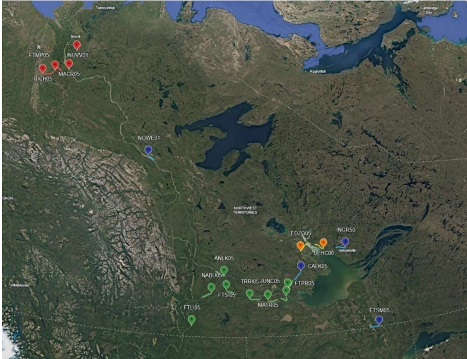
Figure 1. Locations of bumble bee surveys completed under this permit previously.